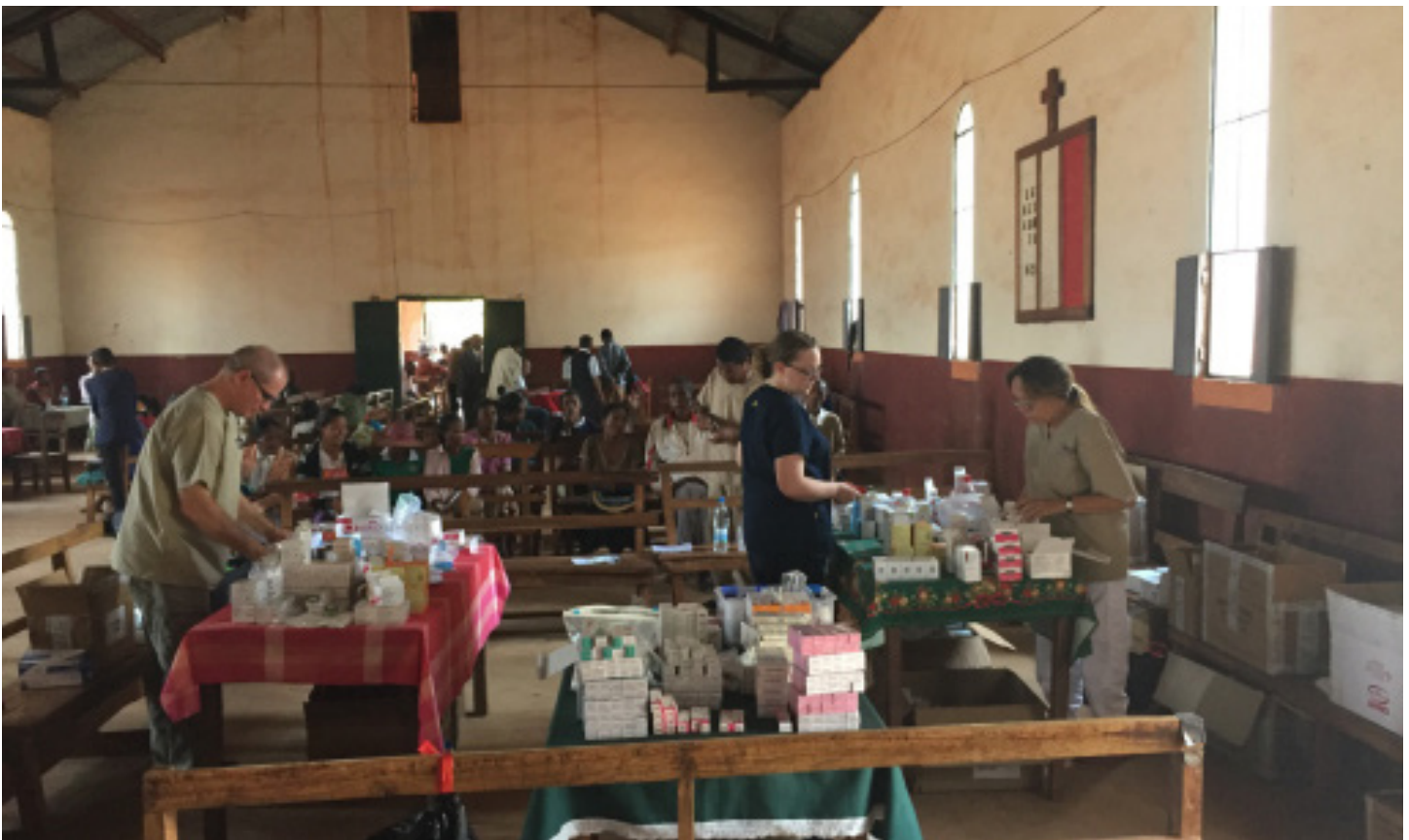
▲ The temporary clinics were set up in churches or other buildings. While the missionaries did not have the conveniences of a hospital, they provided care to hundreds of patients at each site.