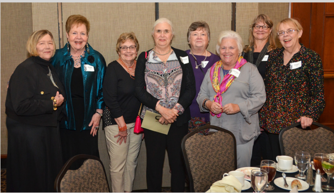
At last year's Annual Awards Banquet, members of the class of 1966 reconnected and celebrated their 50-year reunion.

Please join us this year to celebrate their accomplishments. The Annual Awards Banquet is at 6 p.m. on Friday, April 21, 2017, at the Country Club of Missouri in Columbia, Missouri. There will also be an alumni reunion at the Sinclair School of Nursing at 8:30 a.m. on Saturday, April 22, 2017. The reunion will include a tour of the school and the University of Missouri Hospital. It is open to all SSON alumni, with a special invitation to the graduates of 1957, 1967, 1977, 1987, 1997 and 2007.